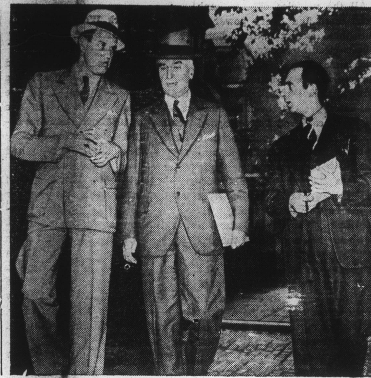
Photograph shows Secretary of State Cordell Hull (center) followed by newsmen as he left the White House after a conference with President Roosevelt on the European situation.