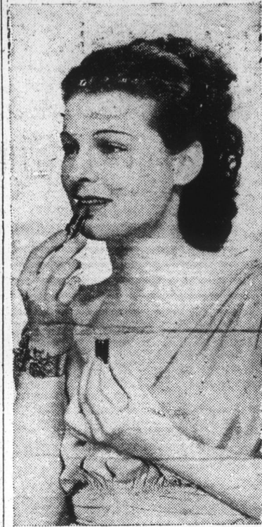
A gold and red lipstick holder carries the favorite lip rouge of Ruth Hussey, and matches in scent the eau de cologne and perfume the player uses.