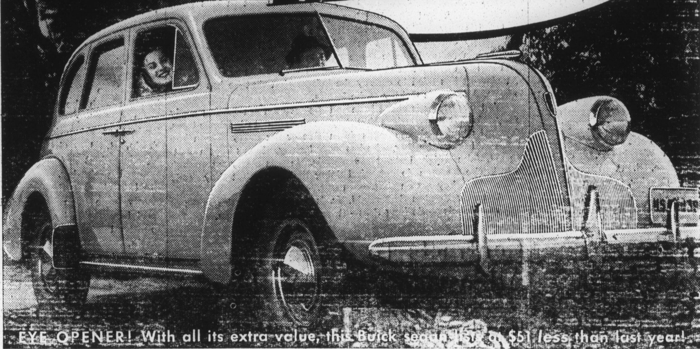
EYE-OPENER! With all its extra value, this Buick sedan is $51 less than last year!

LOOK at it! Standing still, every inch seems itching to get going. Streaming along, as you see it here, it's the perfect picture of perfect action!