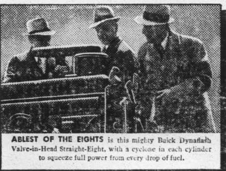
ABLEST OF THE EIGHTS is this mighty Buick Dynaflex Valve-in-Head Straight-Eight, with a cyclone in each cylinder to squeeze full power from every drop of fuel.

In short, you'll have fun! All-winter fun! Fun unspoiled by the fussing and fretting it takes