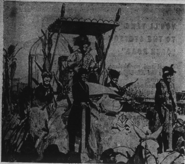
The Zulu King—colored Monarch of Mardi Gras—arrives by barge at the New Basin canal and boards his throne float for the colorful trip through the main street of New Orleans Negro section. During the last day of Mardi Gras festivities, February 21, Negroes meet the tug boat, rechristened a Royal Yacht, and demonstrate their loyalty to their "monarch."