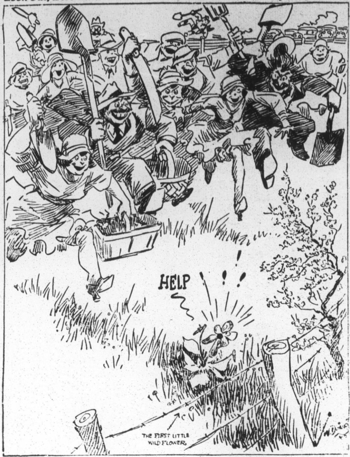
National Wildlife Federation

Look Out, Here Come the Nature Lovers - By Ding Darling