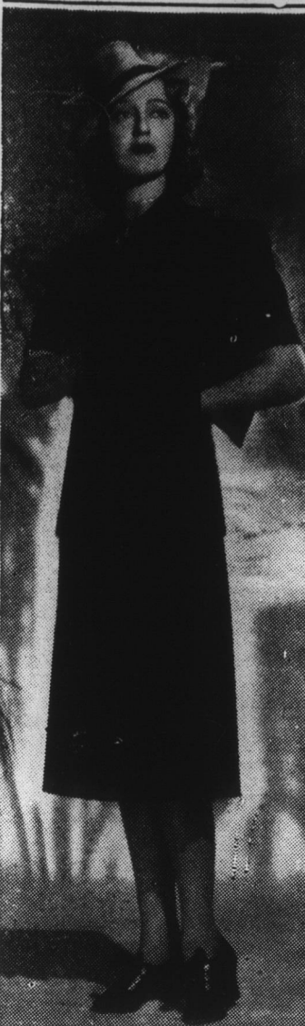
This short-sleeved tailored jacket from the personal wardrobe of Jeanette MacDonald is smart for spring. The jacket is fashioned from tweed in a turquoise and brown mixture. The one-piece frock with box pleated skirt is heavy black crepe. Miss MacDonald chooses a linen straw hat with brown band and quill trim.

value of keeping records from year to year urging a time and place for keeping records and sound methods of keeping them.