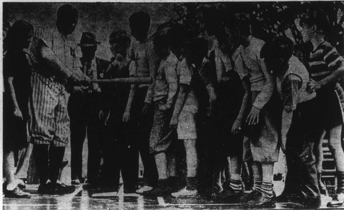
Babe Ruth, former New York Yankee home-run king, and at one time the highest paid player in the history of baseball, conducting the baseball class for boys at the court of sport at the New York World's Fair. The Bambino is showing ambitious youngsters how to use the bat most effectively.