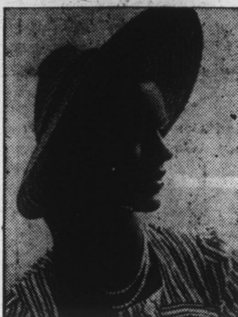
A LITTLE-GIRL bonnet of white straw with long ribbon streamers, as highlighted in Harper's Bazaar for May.