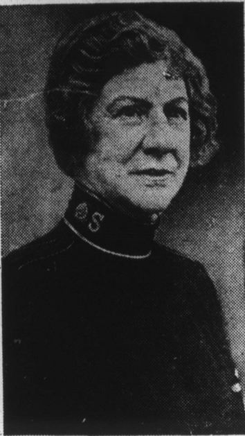
General Evangeline Booth, head of the Salvation Army, at present touring the United States, will return to England in August for the meeting of the Salvation Army high council to select her successor.

There are so few details given in the biography of Jeroboam at this point that it is not easy to fill in the gaps that remain. However, one day certain events happened which precipitated a crisis in the life of man, and determined the way he should henceforth take. Walking along on the outskirts of Jerusalem, thinking of the situation which confronted the people, he was unexpectedly joined by Alijah, one of the leading prophets of the time. We can be very sure that this visit was preceded by a long period of observation of Jeroboam on the part of the prophet, and that the result was a conviction that here was a man of promise, here was one who through character and qualities of leadership gave indication that he, perhaps, should take the leading part in the great drama of national disintegration and reconstruction that the trained mind of the prophet told him would yet appear. So it was that on this particular day, meeting Jeroboam walking alone, Alijah drew him aside, rent his garment,