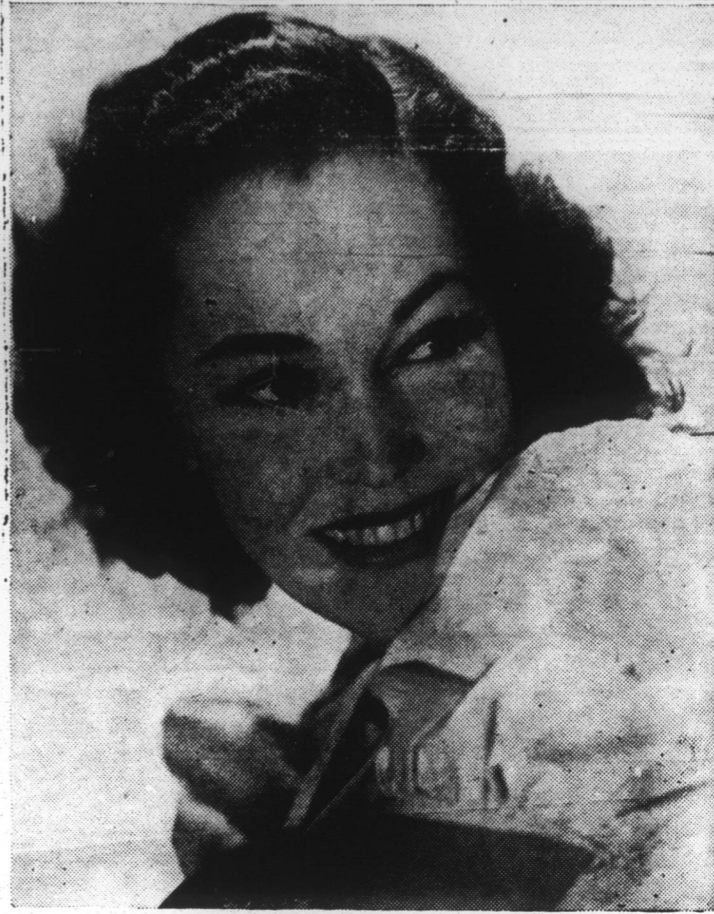
Maureen O'Sullivan, who was born on the Emerald Isle at Boyle, is Ireland's gift to Hollywood.