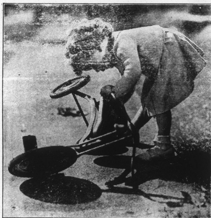
Your child pictures will be more interesting if they "tell a story." Show the child busy at something—such as this repair job. And don't stand too far back.

VIRTUALLY every parent takes snapshots of the children—and would like to take better ones. It's not difficult to take a good child picture, and there's no subject more appealing. But most of these pictures can be made still better, if attention is paid to a few common, easily-corrected faults.