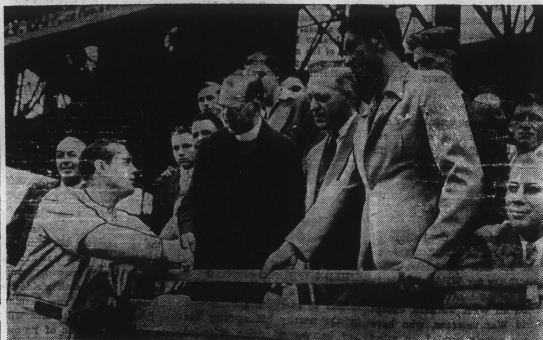
Bill Terry, manager of the New York Giants, extended a welcome hand to Father Flanagan and his charges from Boys Town, Neb., just before the Giant-Cub game at Wrigley field in Chicago. The boys were on a baseball tour, having won the championship in a Boys Town tournament. They didn't bring Terry luck, however, as the Cubs managed to win the game with a ninth-inning homer.