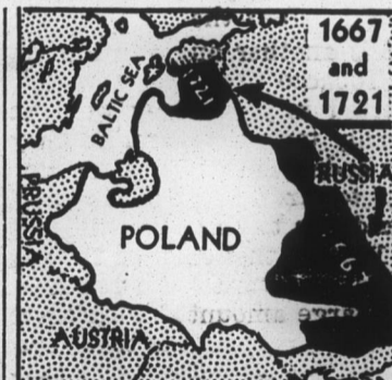
Poland began to disintegrate with the rise of power of the Teutonic knights in East Prussia. Russia began taking land when the Teutons caused internal strife.