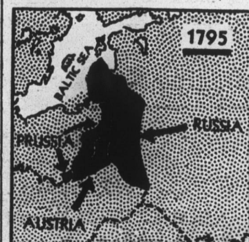
The third partition, occurring in 1795, caused Poland to disappear altogether. Russia, Prussia and Austria shared the spoils.