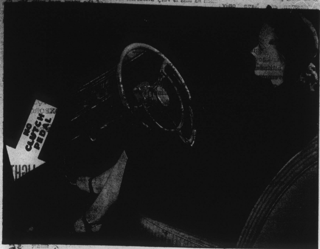
The clutch and clutch pedal have been entirely eliminated in the 1940 Oldsmobiles equipped with the new "Hydra-Matic Drive." With this sensational device, exclusive to Oldsmobile, all the driver has to do is step on the accelerator, steer and stop. Photo shows the front compartment of an Oldsmobile equipped with "Hydra-Matic Drive."