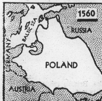
Boundaries of Poland in 1560, after the marriage of Queen Jadwiga of Poland and King Jagello of Lithuania. Lands of the two nations were combined.