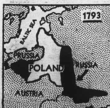
Russia and Prussia alone shared in the second partition of Poland, which left that country with little original territory.