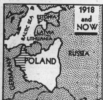
Poland declared its right to autonomy in 1918. Shaded area shows old German boundary restored by Hitler's decree.