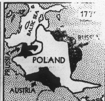
Poland's first partition took place in 1772, when Russia, Prussia and Austria each took lands; Russia to the northwest, Prussia to the east, Austria, south.