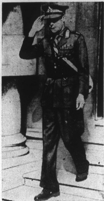
In full kit of an English major general, the once-exiled duke of Windsor leaves the London war office en route to the French battle front. Observers noticed the duke preserved his distinctive dress even in wartime, wearing non-regulation shoes.