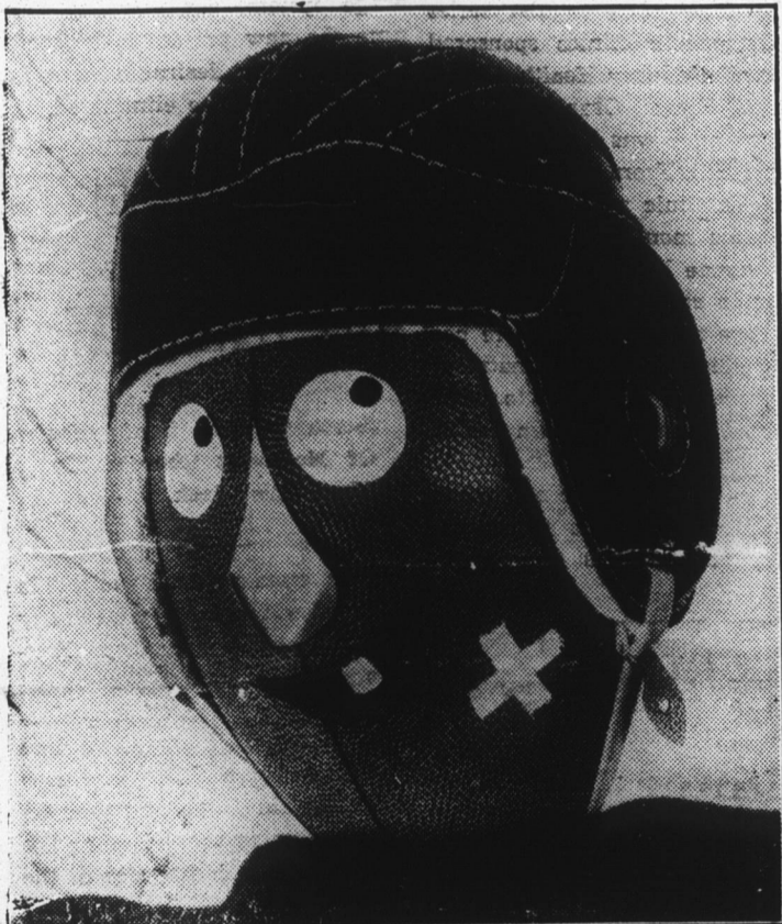
A simple "table-top" shot, this football hero would add fun to any album. Try table-top photography—you'll like it.

Now is the time to sell the best tobacco you have, as prices are up on the better grades at all houses. Tobacco is selling good, so bring your next load to Roxboro and get the service and prices you are expecting.