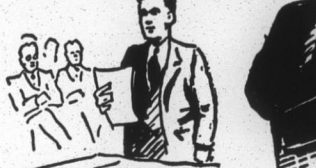
HE SERVED AS MEMBER OF NORTH CAROLINA STATE SENATE THREE TIMES (1931-1937-1939)