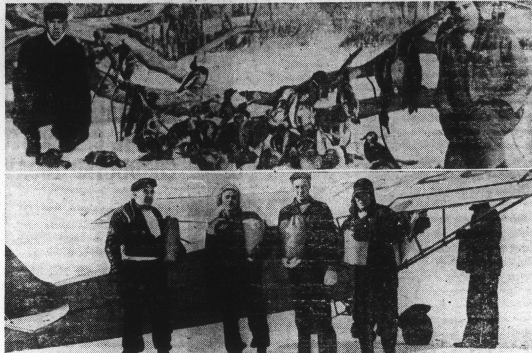
More than 50,000 wild ducks were saved from starvation when Illinois sportsmen distributed six tons of grain from the air along the Illinois river in the LaSalle region. The feed was distributed by the airplanes in ice-locked sloughs and back waters. Top: Some of the hundreds of ducks already dead from starvation. Bottom: Loading shelled corn in the plane at the LaSalle-Peru, Ill., airport.