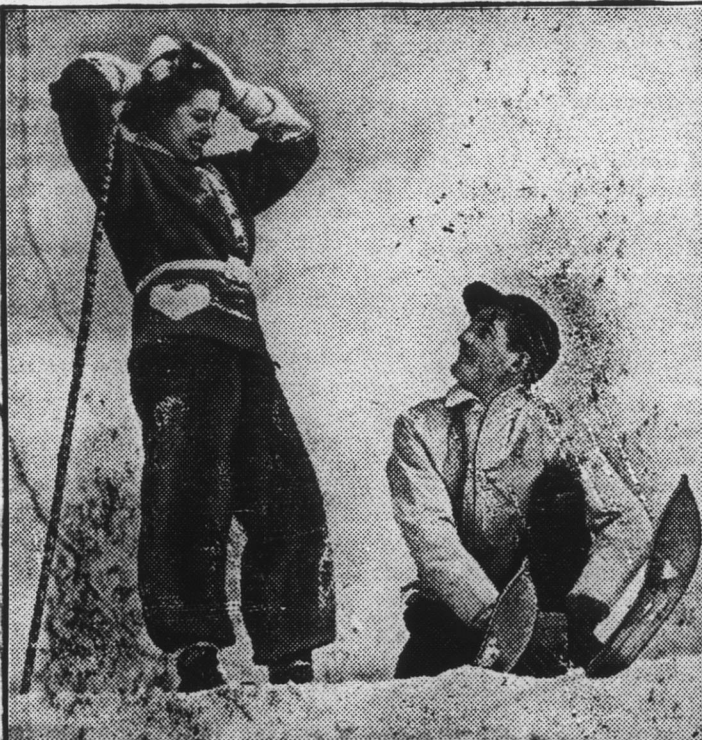
The sky background helps this picture, because the subjects stand out clearly against it.

EVERYBODY wants to take good, clear pictures—pictures that are sharp and have plenty of detail. This isn't hard to do—if you'll watch both the subject AND the background when you're taking a picture.