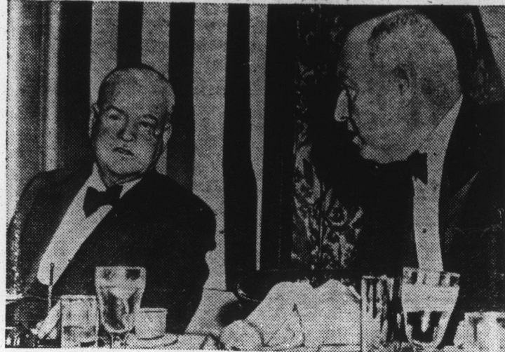
Herbert Hoover, left, former Republican president, and James A. Farley, United States postmaster general and chairman of the Democratic national committee, indulge in a friendly chat at the annual baseball writers' dinner in New York city. It was the sports writers' seventeenth annual "eating and oratorical contest."