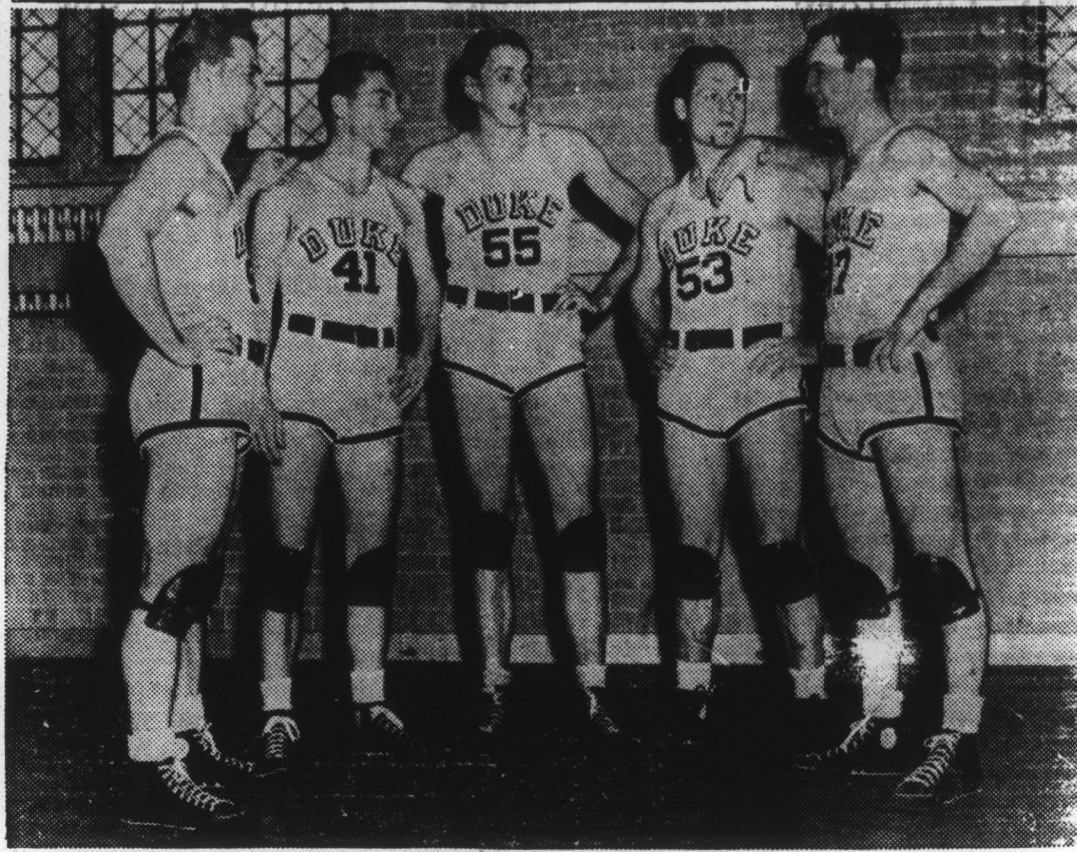
The above group of court stars are one of the best cage teams Duke university has ever sponsored and they proved this over the week end in what turned out to be one of the best Southern conference tournaments ever staged in Raleigh.