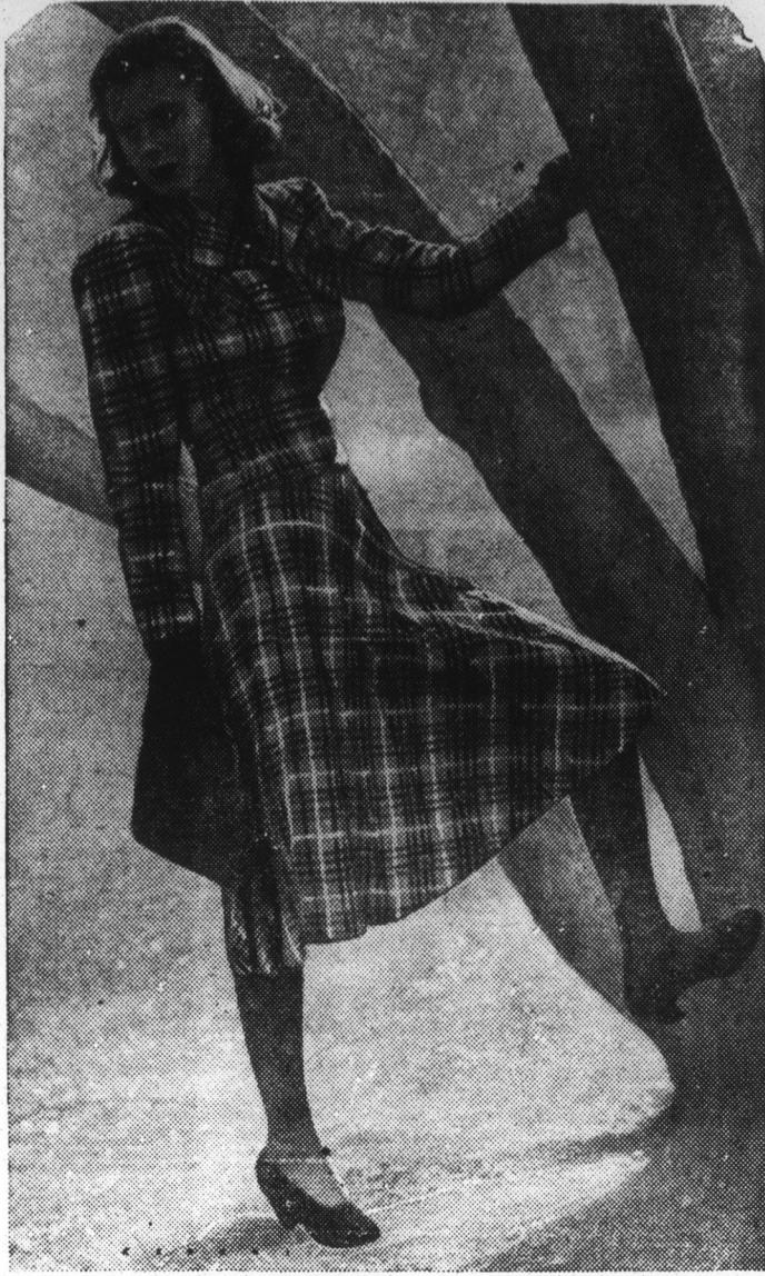
SPRING of 1940 is due to witness a riot of color according to the February Harper's Bazaar. The gay and daring are advised that sulphur yellow and electric blue are the colors in this happy but loud plaid wool. It can be worn with a soft pull-over or with a blouse