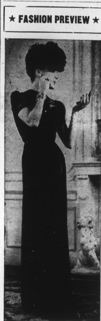
WAR or no war, women still dress for dinner in Paris, eternal city of fashion. This is a Schiaparelli creation of black crepe with a slight V in back, as reproduced in the March 15th Harper's Bazaar. The hat is of black ostrich.