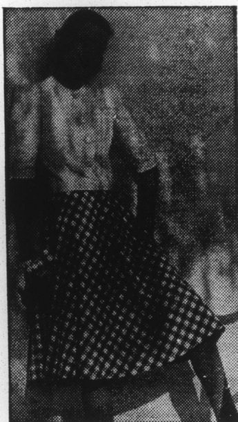
Smart as paint are the new checked frocks that will be worn this summer. In all kinds of material they appear to advantage aided by clever accessories. May Good Housekeeping suggests the above practical ensemble of a brown-and-white, green-and-white or black-and-white gingham dress worn with a brisk little pique jacket.