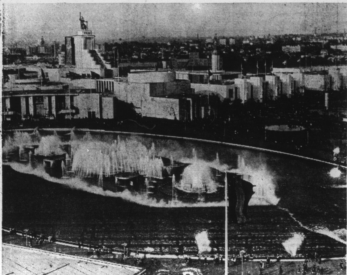
Visitors enjoy the cool breezes stirred up by the famous fountains in the Lagoon of Nations as they globe-trot the world in miniature in the foreign area of the World's Fair of 1940 in New York. Entirely revised, the big exposition opening May 11 has a lowered admission price and many new exhibits.