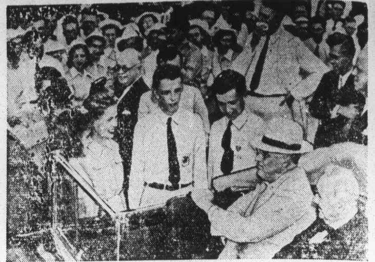
President Franklin D. Roosevelt is here shown visiting with one hundred and seventy boys and girls from forty-three states encamped at the fourteenth annual party of the 4-H clubs. The 4-H club members are evidently, keenly enjoying this visit with the Chief. Josephus Daniels, United States ambassador to Mexico, is sitting in the car with the President