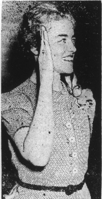
Margaret Chase Smith, wife of the late Rep. Clyde Smith (R.) of Maine, being sworn in to fill the vacancy left by him. Mrs. Smith is the eighth woman in congress.