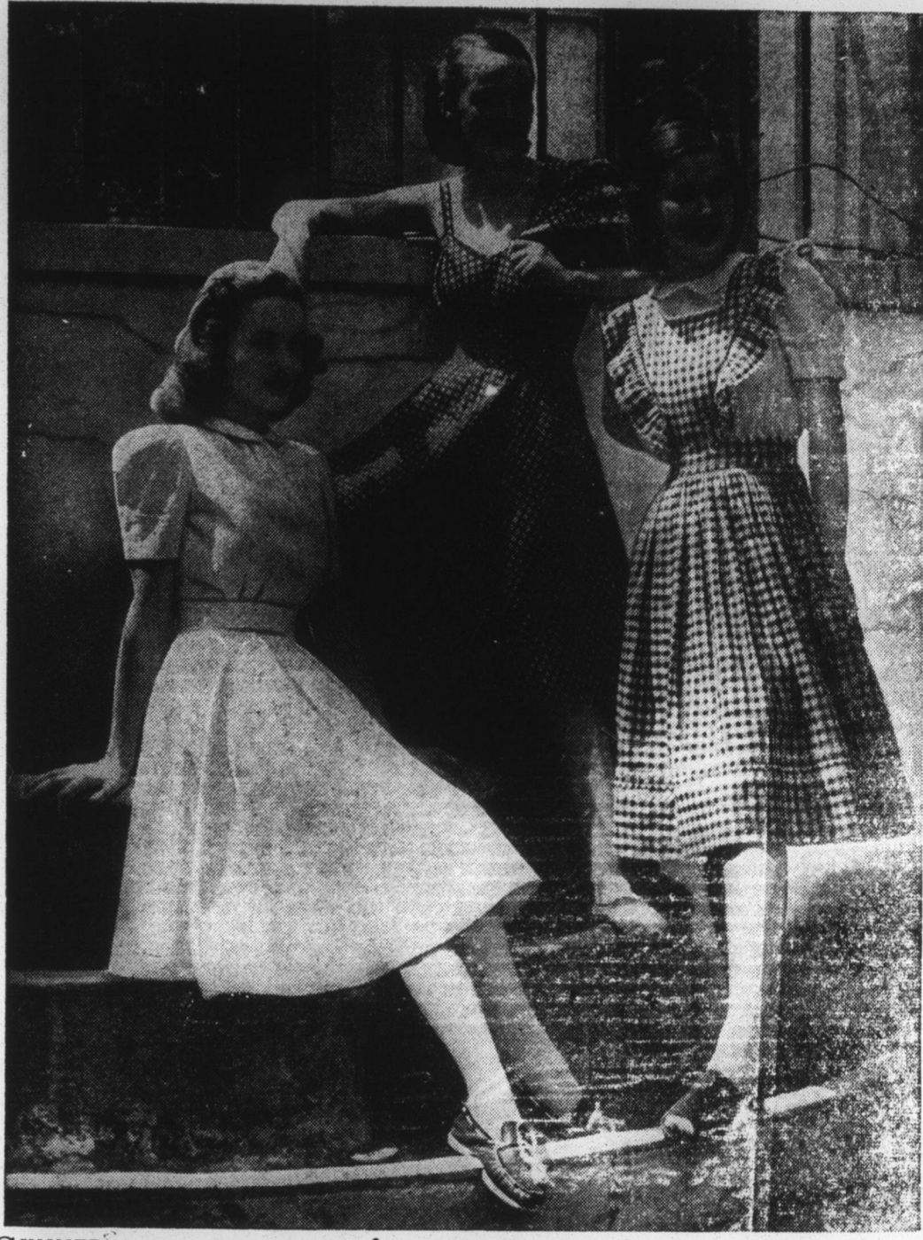
SUMMER teen-agers demand crispness and freshness in their frocks while acknowledging a new budgeting. The three dresses above are the answer offered in the June Harper's Bazaar. On the left is a white pique dress, very fitted for a slim waister, with shiny gold buttons down the back and on big pockets. Center is a backless shoulder-strap dress of bright red Everlast pique in a plain American print. There is a Basque jacket of glazed chintz in the same pattern. On the right is an apron pinafore of red and white imported checked gingham, with ruffles on the bib and a white pique blouse. All are washable and budget-easy.