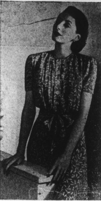
FOR any occasion, for town or country wear, for the smart young married, Harper's Bazaar suggests the above. Its cool charm and dignity are the result of gray Enka rayon, printed with white feathers and accented by a graceful sash bow tied in front.