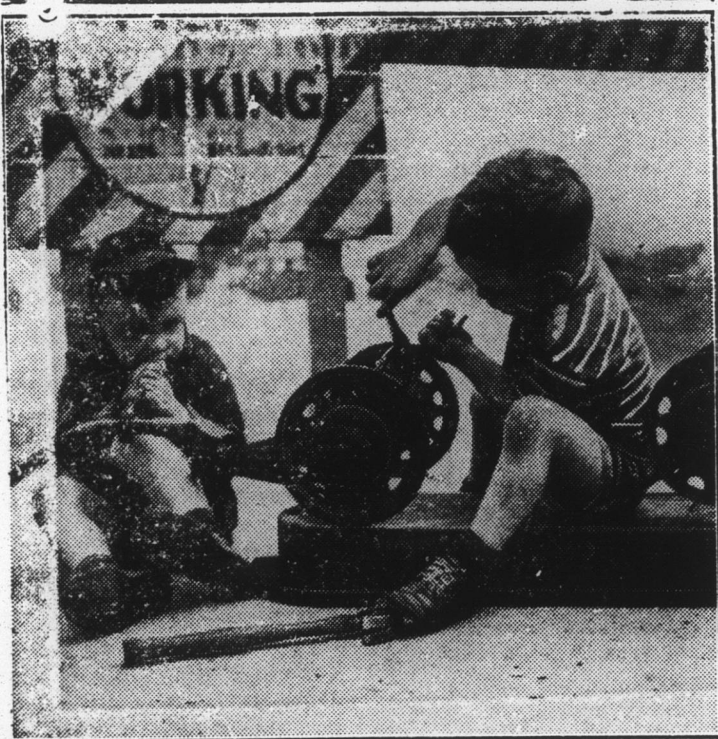
Make your pictures pointed. In this shot, the sign helps tell the story. Such details often "make" a picture.