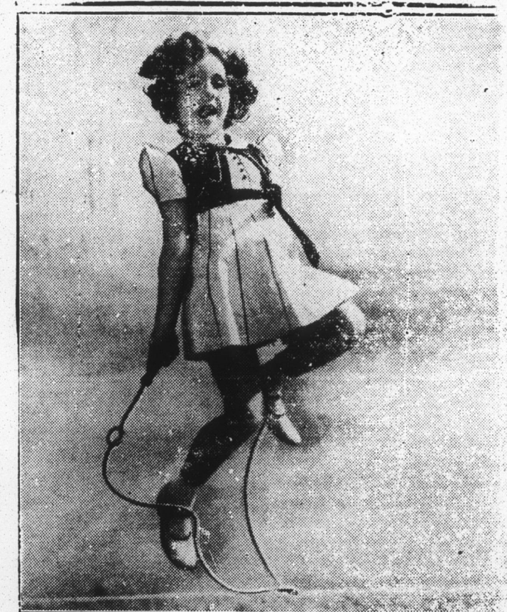
Lively action shots, like this, are taboo for the slow lens—but the fast lens and fast shutter get them easily.

However, we have an idea that Durham supporters will come through and see to it that the Bulls play again next year.