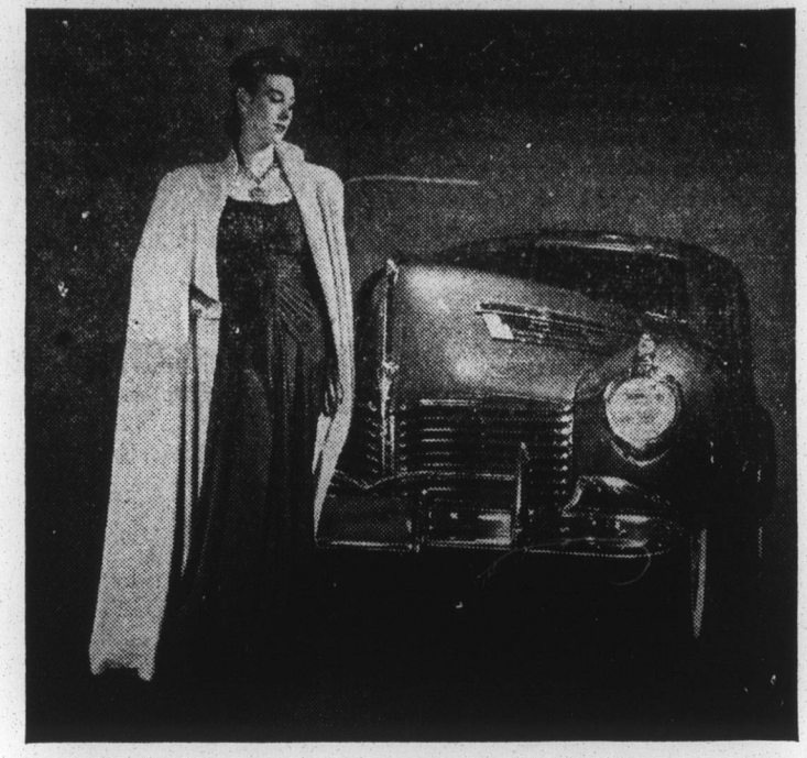
SLEEK is the word for this full-length cape of Stroock wool, designed by the Hudson Motor people and turned over to Harper's Bazaar for exhibition at the New York Automobile Show. Credit the Commodore Custom Sedan, pictured here, for the cape's inspiration. Harper's for November features a section of automobile creations in dress.