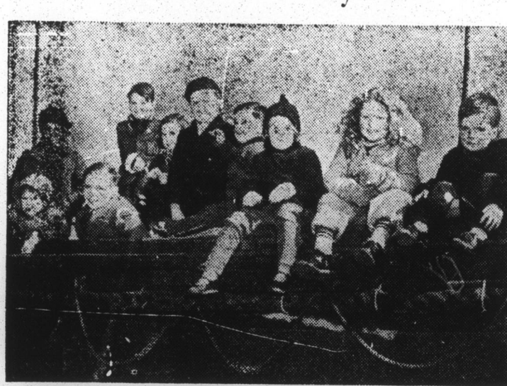
These British children were assigned to this lifeboat on the S. S. Georgic during its hazardous journey to New York. When the steamship docked the children used the boat, which was to be their watery home in case of torpedoing, as a sort of playroom. The Georgic was the first British passenger ship to dock in New York since November 18, 1940.