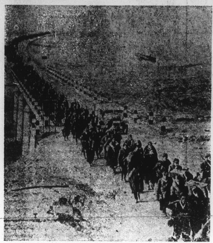
A seemingly never-ending stream of Italian priseners is here shown pouring over a bridge following the capture of an important base during the British sweep west through Libya, which was alimaxed by the capture of Bengazi, an Italian stronghold. In all, the British captured 109,000