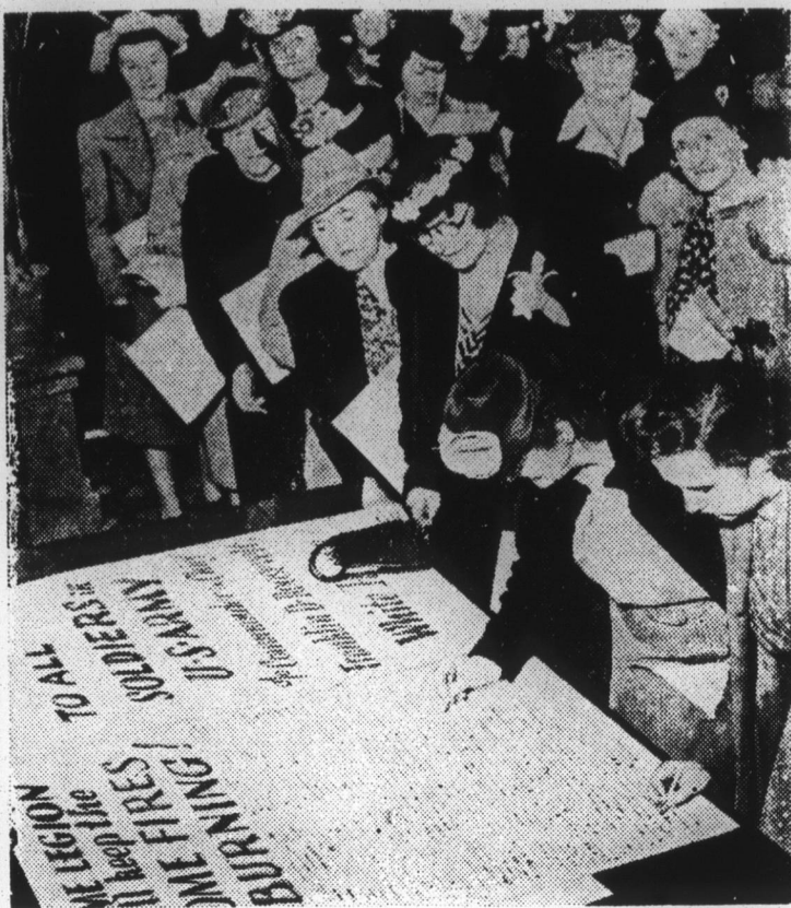
A group of army mothers who attended the organization meeting of the Home Legion in New York city, signing a huge post card which was mailed to the President by those pledged to do all in their power to make the lot of the soldier in camp a happier one. The Home Legion is composed of wives, mothers, sisters and sweethearts of draftees.