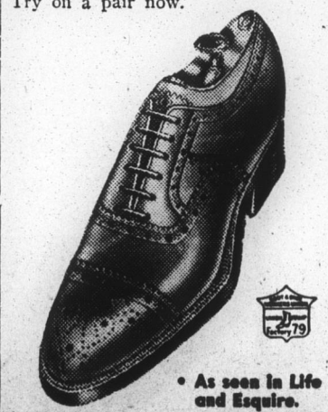
As seen in Life and Esquire.

For the man who prides himself on good taste — and knows that discriminating men and women recognize that quality, in his choice of these handsome Crosby Squares for town and business. Inspired by costly custom-made shoes, they offer the comfort gentlemen demand... Try on a pair now.