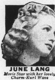
JUNE LANG Movie Star with her lovely Charm-Kurl Wave