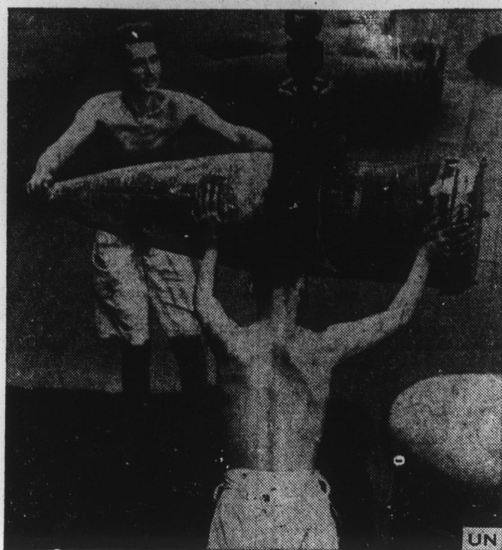
FIFTEEN-INCH SHELLS from the guns of the battleship "Warspite," lying off the beaches of Salerno, helped blast a path for the advancing American Fifth Army and accompanying British troops. This picture shows British sailors hoisting one of these massive shells aboard the "Warspite"—veteran of Jutland in World War I and of Narvik, Crete and Cape Matapan in this war.