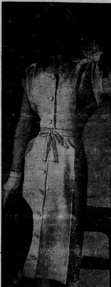
A white linen dress, made with open sleeves, scooped out neck and wing sleeves by Adele Simpson spells cool perfection for summer.

Let us assume that you have cut the seat part and the band (which should be one inch wider than the depth of the mattress) to go around the mattress part. Then you are ready to cut the pleated exten-