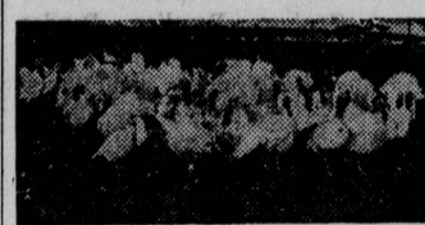
A good stand of pasture will save turkey feed.

Saves in Grain Feeds Not only will the pasturing of turkeys and poultry, if properly conducted, result in soil conservation, but considerable saving in grain will result.