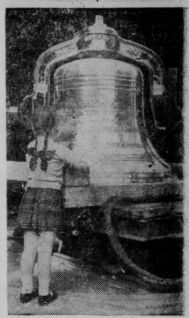
BELL TO HONOR HERO . . . A pig-tailed little girl is reading the inscription on the bell whose tolling will be a ringing memorial to the late Gen. George S. Patton, former commander of the U. S. 3rd army. It was presented to St. John's Episcopal church, Beverly Farms, Mass.

force all to join and come under the number or name, and that is this communist tha its organizing ever plant and doing packing houses and all God says here is wisdom and he says if we do these things or believe these lies that these leaders tell he will turn us over to a repobate mind that we might believe a lie and be damed. I would love to know how many labor leaders has ever asked men and women to get right with God and go to church and do right we need preachers today that will warn people of this great enemy if we teach any thing that God does not we are guilty of breaking the whole Bible God says do unto us. Wonder how these leaders as Lewis, Green and Browder would feel if some men would go to there home and tell them what to do that is just like they do these plant owners. God says in the Bible false teachers will come and deceive many, and God says if any man even an angel bring to any other Gospel which is any way besides Gods way not to even keep his company or eat with him or bid him Gods speed if we de we are guilty of his evil deeds so we had better be careful what we join these days. God says not to be readers and hearers only of the word but to be doers of the word, and God said to shun the aplice of evil and this thing equaled linked together with it is against God and we can't be what we say God said some would