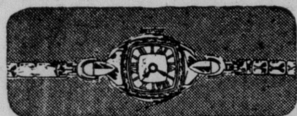
LADIES' 17J WRIST WATCH $33.75