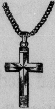
SOLID GOLD CROSS & CHAIN $7.95