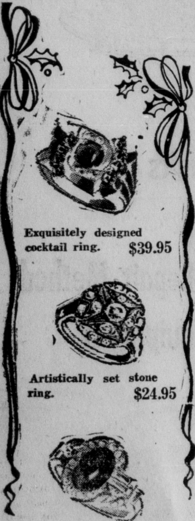
Exquisitely designed cocktail ring. $39.95

GIFTS OF JEWELRY ARE GIFTS OF A LIFETIME