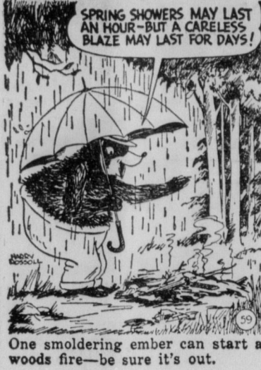
One smoldering ember can start a woods fire—be sure it's out.