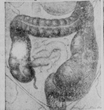
CONSTIPATION is the cause of this atonic abnormal condition of this colon. IMPORTANT: Keep colon free from poisonous waste matter.