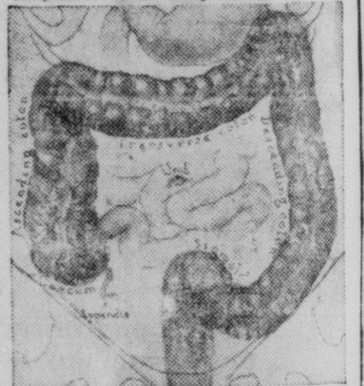
THE IDEAL COLON. A person in perfect health possesses a colon like this—firm and regular, with well functioning muscle.

THE COLON is one of the most important organs of our body. The following illustrations show the colon in various forms, as one's condition in health may be. You may ask: How is my colon?