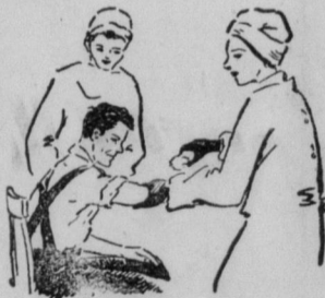
Health and Welfare Programs Maintained

And so on—an impressive array of sorely needed services and facilities made possible by the apportionment of beer tax revenue to towns, cities and counties licensing the sale of beer.