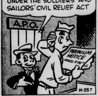
For full information contact your VETERANS ADMINISTRATION Office

SERVICEMEN UNABLE TO PAY PREMIUMS ON THEIR COMMERCIAL LIFE INSURANCE POLICIES MAY ASK V-A TO GUARANTEE THE PAYMENTS UNDER THE SOLDIERS' AND SAILORS' CIVIL RELIEF ACT