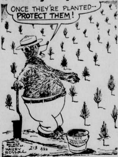
Remember—fire kills young trees!