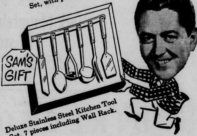
Deluxe Stainless Steel Kitchen Tool Set. 7 pieces including Wall Rack.