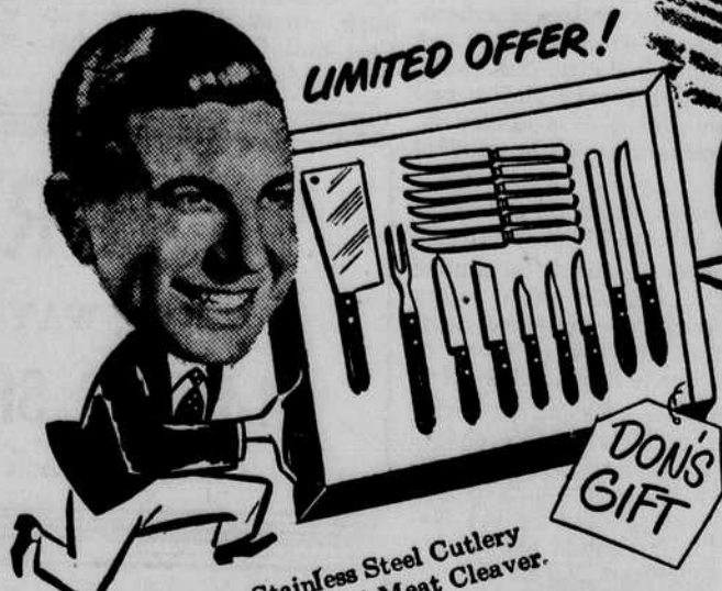
A luxurious Stainless Steel Cutlery Set, with polished steel Meat Cleaver.