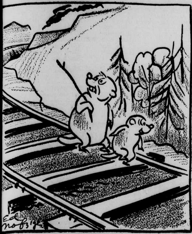
Forest Service, U. S. Department of Agriculture

Of course trains still run on wood—3,000 cross ties go into a mile of track."