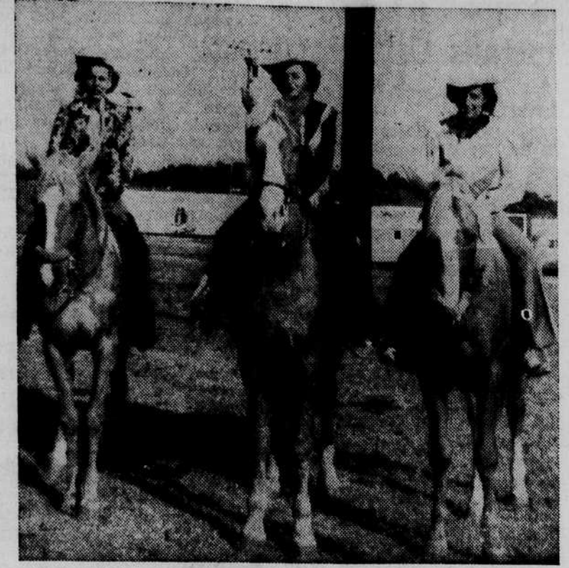
Three of the many ridin', ropin' beauties appearing with a score of other cowgirls and cowboys and clowns and 50 head of stock at the big Cherokee ranch rodeo at grammar school field in Black Mountain on Wednesday and Thursday, June 11-12, for benefit of Jaycee civic improvement fund.