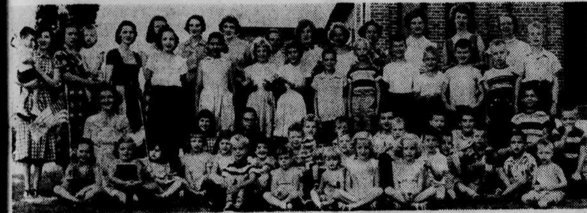
Shown above are the boys and girls, with their leaders, that attended the Bible school at the Swannanoa Presbyterian church. There was an average daily attendance of 54, with 49 of these having perfect attendance. Closing exercises were held Friday night. Each department took part in the program. There was an exhibit of handiwork that was made during the school.