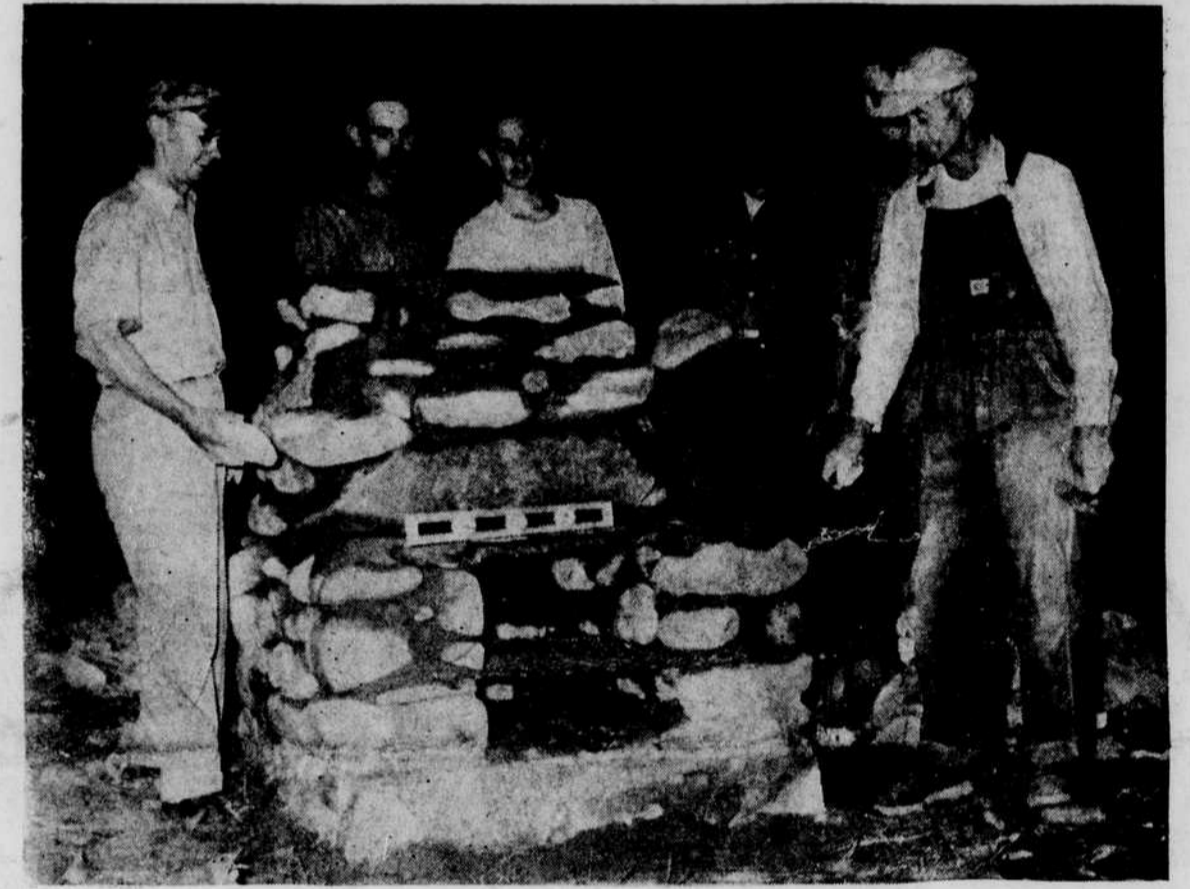
Other workers examine completed furnace on Swannanoa picnic grounds on Grovemont Plaza.