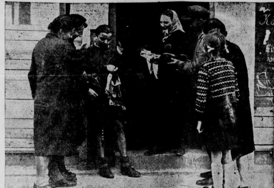
Used clothing from America, distributed in Germany, helps thousands of refugees. The above is a daily scene in West Berlin where over one thousand new refugees register at church relief headquarters every day to ask for food, clothing and accommodation. The refugees are fed, clothed and then flown to the West zones of Germany where further efforts for their rehabilitation are made.