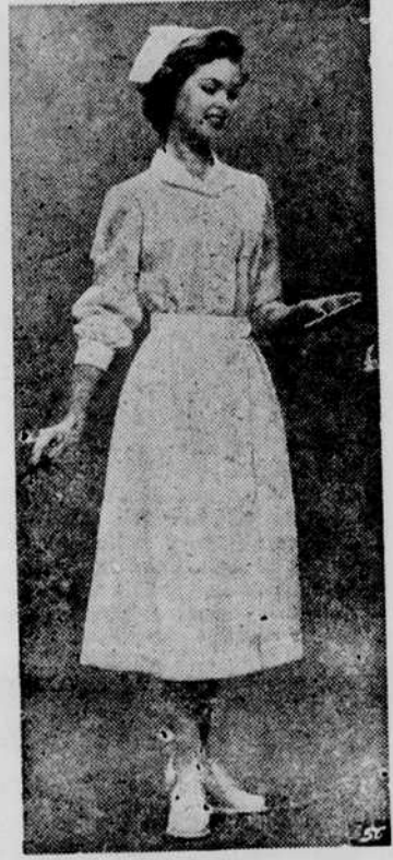
easy to take care of by including the new Dacron uniform pictured above. This wrinkle resistant uniform is made of a specially designed striped weave fabric

A nurse can have an extensive wardrobe for her "on duty" hours that is pretty and feminine while still neat and professional looking. Plus it can be